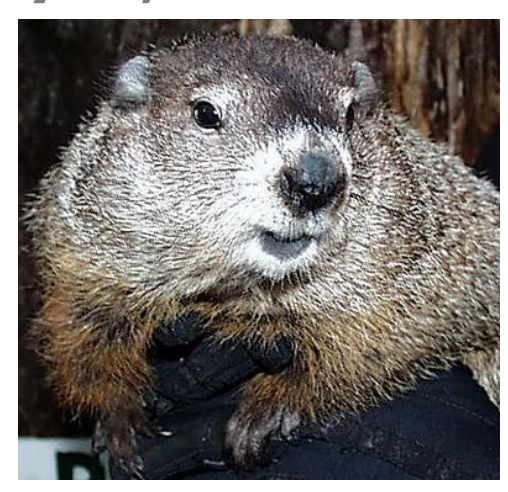
C. Tech joins The Force!

C. Tech Predicts ... improved financial climate when you place your accounts with us.